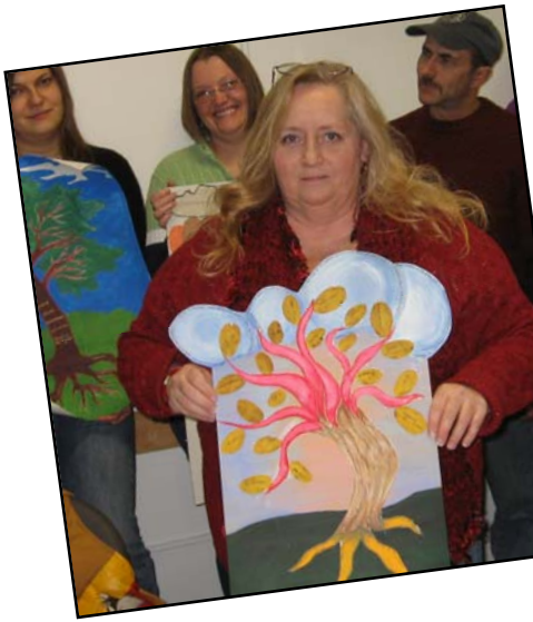
College Transitions Class, Sumner