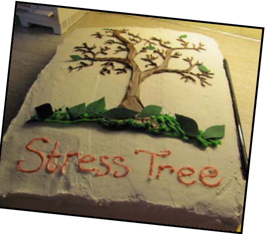
Adult Education, Sullivan, Maine