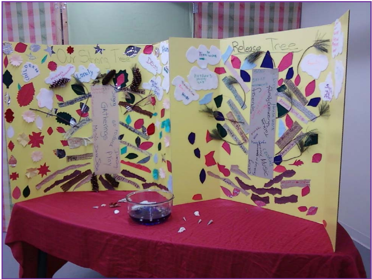
Group Stress Tree, Project Hope, Roxbury, MA. For a description on using stress trees, please see Jeymi Arroyo's lesson plan .